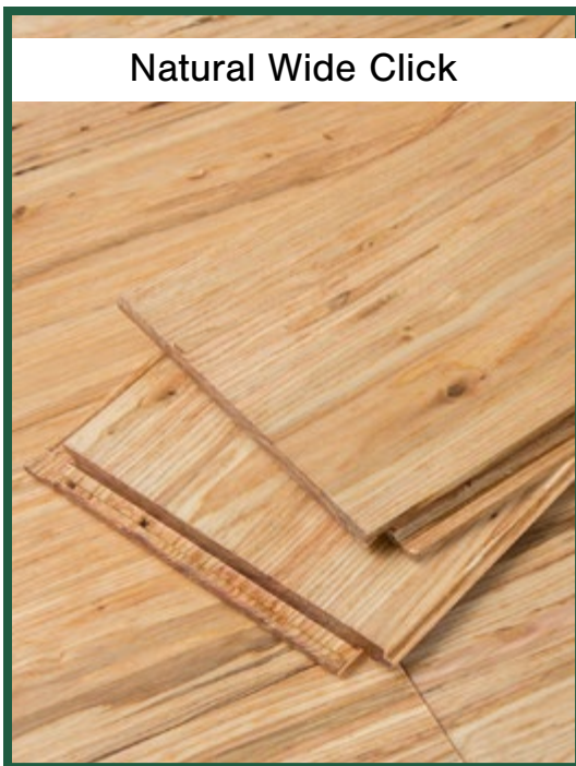
Natural Wide Click