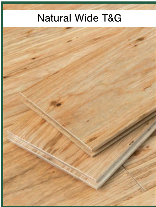
Natural Wide T&G