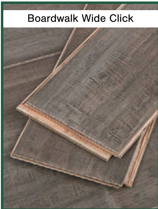
Boardwalk Wide Click