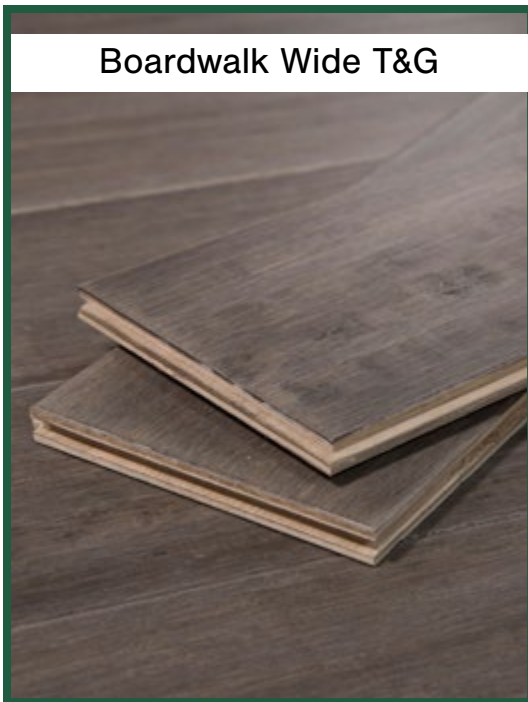
Boardwalk Wide T&G