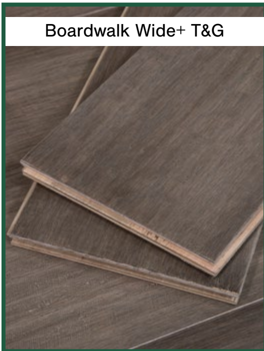
Boardwalk Wide+ T&G