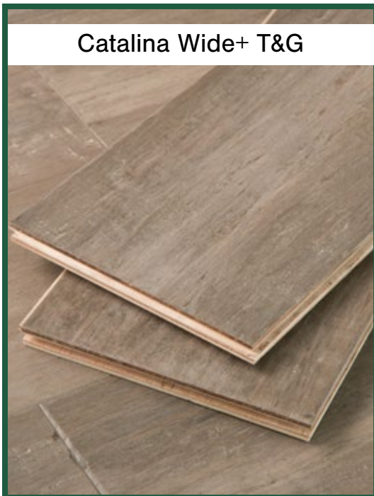
Catalina Wide+ T&G