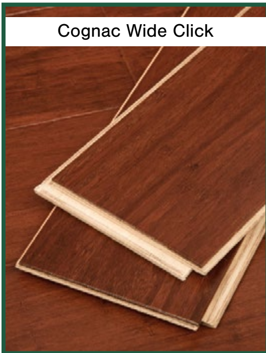
Cognac Wide Click