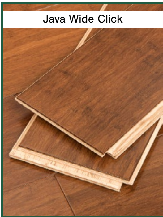
Java Wide Click