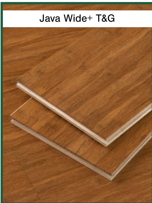
Java Wide+ T&G