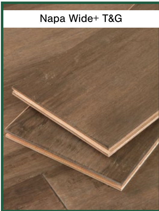
Napa Wide+ T&G