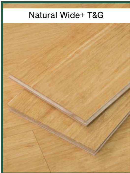
Natural Wide+ T&G